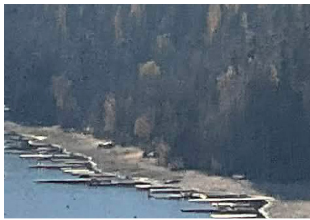
Lake view, Lynn Rosman