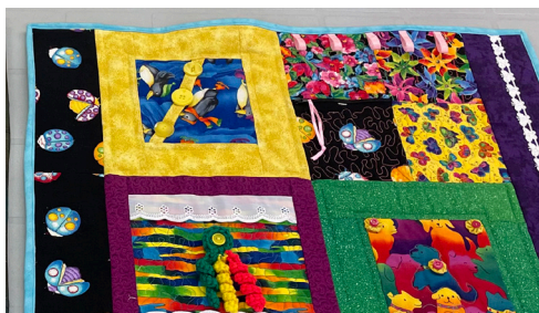
First Fidget Quilts!

We also make baby quilts for all the new Kingfisher babies!