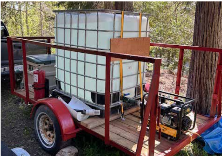
Fire trailer equipped with a 1200 litre tank, 7.5 hp pump, fire hoses and a fire extinguisher.