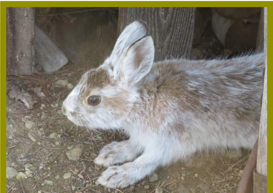
A visitor to Heywood Hill woodshed

Art Herbert 3080 Mabel Lake Road, Enderby, B C, V0E 1V5 838-9759 candaherbert@gmail.com . $30/family and $20/single.